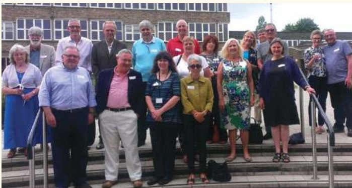
Class of 1974

On Saturday 11th June, the Classes of 70 and 74 had a 'Grand' Reunion at the Royal Latin. Several months of chasing contacts and planning resulted in an exceptional afternoon and evening with a total of 60 Old Latins and partners between the two year groups. Indeed, those travelling from a distance had made a whole weekend of meeting up with friends again. It was so good to make acquaintances again with those 'names' etched in our memories of the RLS. The Class of 74 have had several reunions, but for the Class of 70 there had been just one – some 25 years ago.