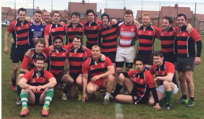
Victorious Old Latins XV

A great day of rugby was had on 1st May 2016, when Buckingham RUFC kindly hosted a match between the alumni of RLS and Akeley, along with a friendly between the two first XVs.