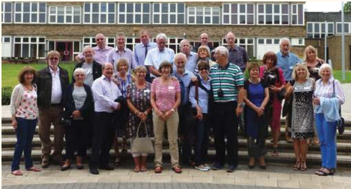
Class of 1970