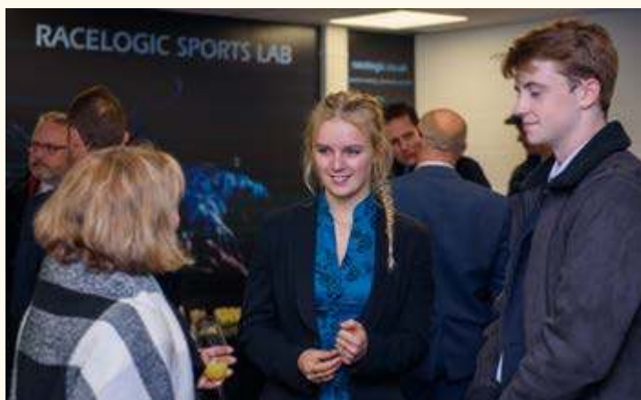
6th formers chat to guests