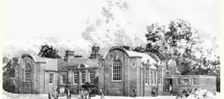
Chandos Road building plans in the 1920s