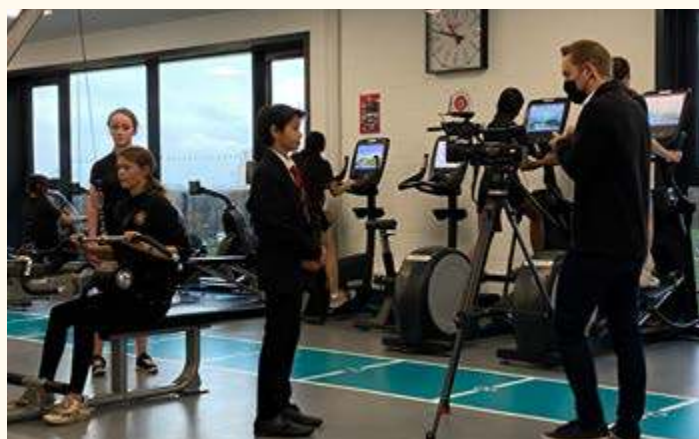
Students starred in a fantastic BBC South Today report from the Sports Campus