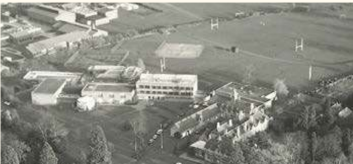
1980s aerial shot of the current site