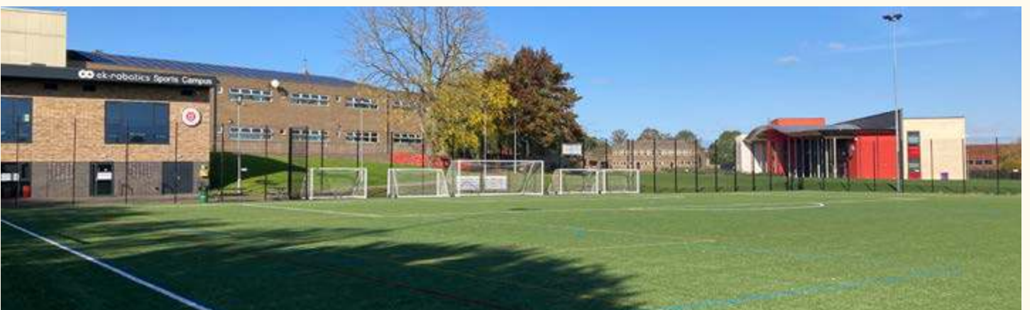
The site today, as seen from the new Sports Campus 3G pitch