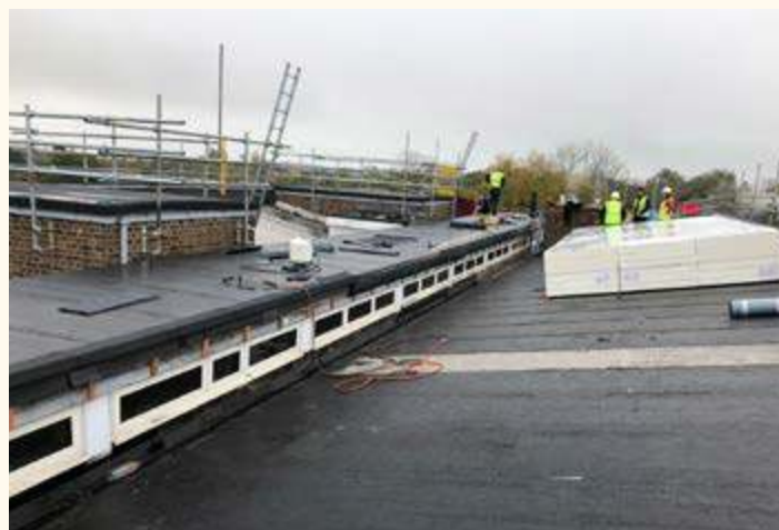
Main block roof works, including insulation block installation