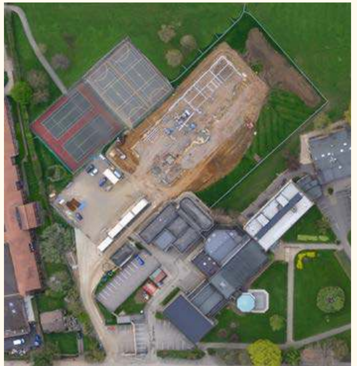
Aerial shot showing the Discovery Centre under construction