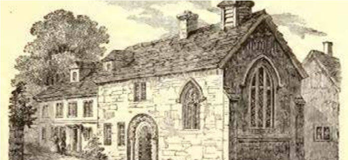
The Chantry Chapel