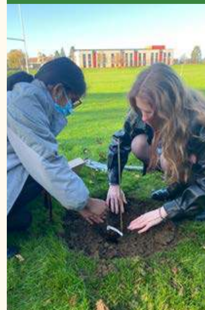
Students planting an English Oak in November for the Queen's Platinum Jubilee!

We'd love to hear from you via any of these methods before the next edition of Latin Life, so next time you're online please take a moment to get in touch. Thank you!