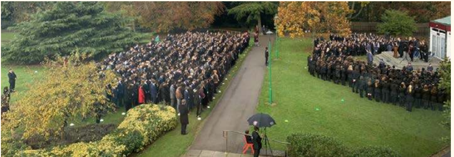
The whole school gathers on the front lawn