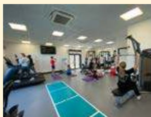
Take a look inside the new Sports Campus