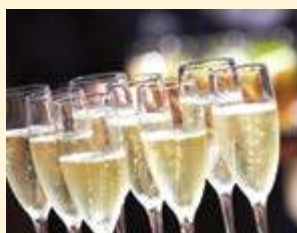
The Countdown to 2023 begins