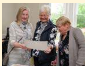
Archive Day 2022