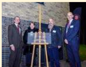
We Did it! ek Sports Campus opens