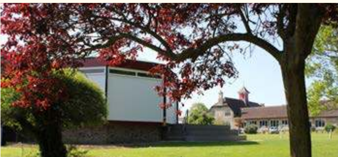
The Green Room and Brookfield