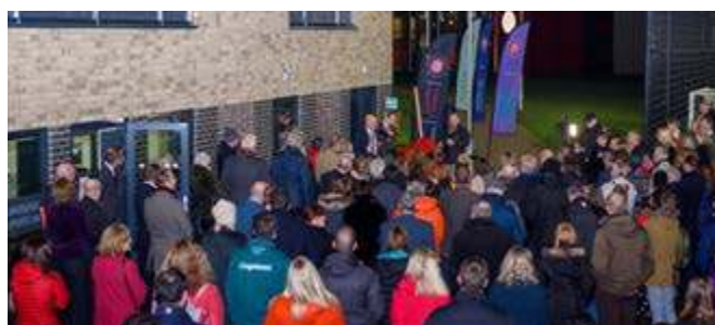
Guests assemble to watch the official opening and speeches

"I'm so impressed by what the Royal Latin has achieved for school and community sport, and I love the way you've brought sporting heroes into the heart of the project. I'm really delighted to have been asked to cut the ribbon to officially open the Sports Campus, and to give the inaugural community lecture – it is imperative that we embed positive experiences which inspire people of all ages to be more active, and this is a fabulous model for other schools and communities to follow. This is a fabulous project delivered by an outstanding team, that will make a real and lasting difference to children's education and health. Congratulations."