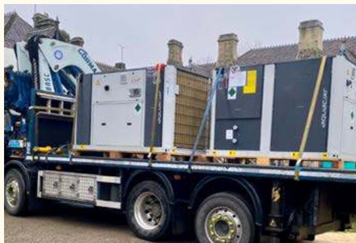
The new air source heat pumps arriving on site