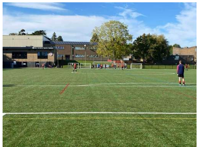
The 3G Pitch in action

The facilities are incredible, especially compared to what they were like in 'my day'. The 3G pitch is a game changer and the standard of football that the boys and girls play now is far superior to the quality of football played on those muddy grass pitches that I can remember 15-20 years ago!