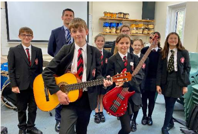
Students from across the school participated in the first lunchtime concert of the year in September