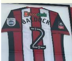
Remembering Old Latins