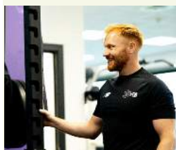
Interview with an Old Latin member of staff