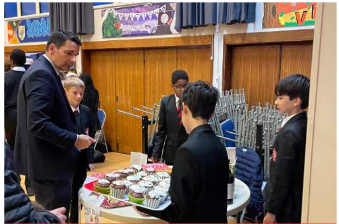
Year 8 Christmas Fair