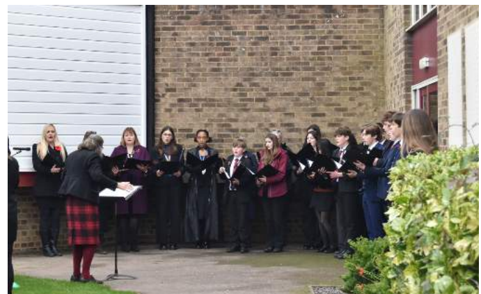
The Chamber Choir