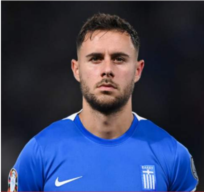
George playing for Greece earlier this year