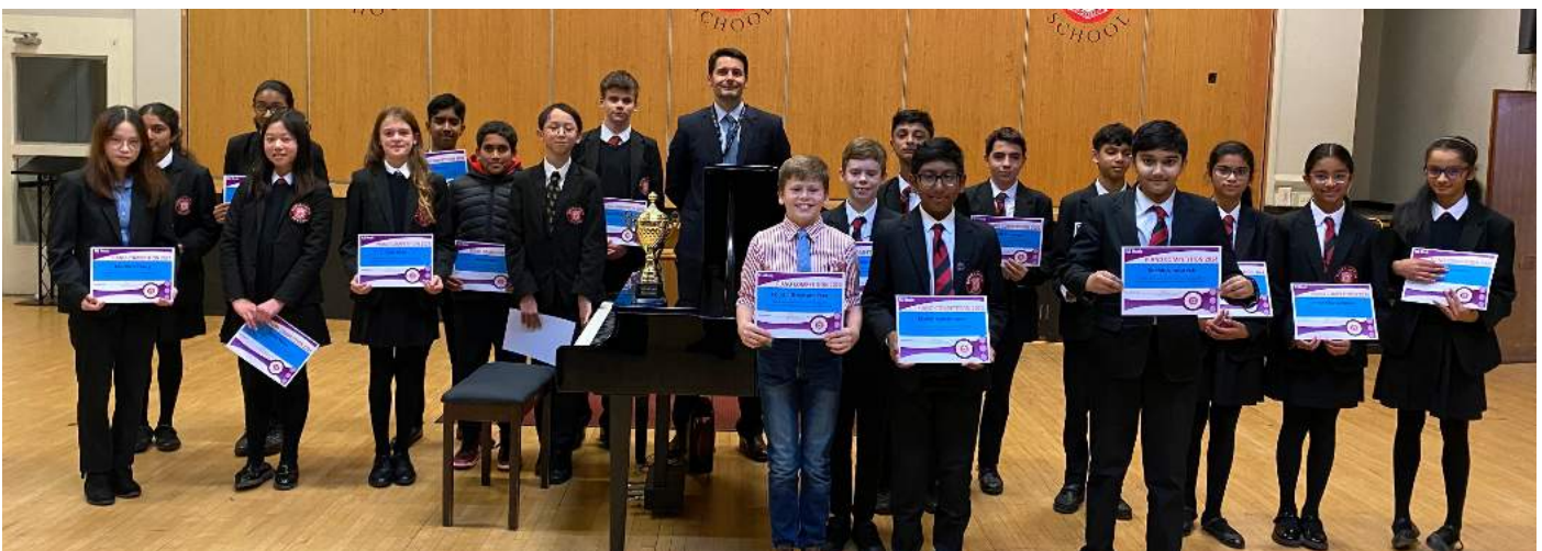
The 19 student finalists of the RLS Piano Competition 2024