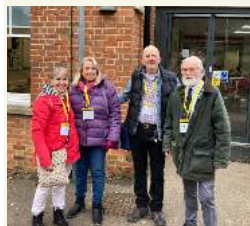
Old Latins back in school