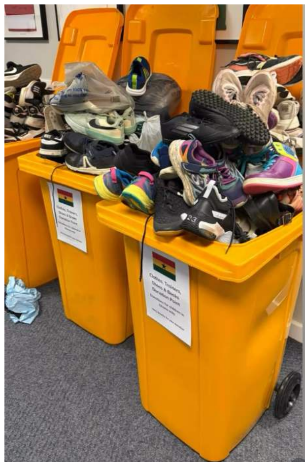
Donations of trainers from RLS students on non-uniform day

To find out more about Akwaaba Volunteers, visit their website here: akwaabavolunteers.org.uk