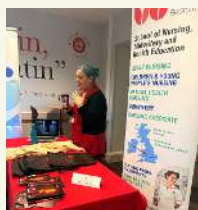
Old Latins back in school