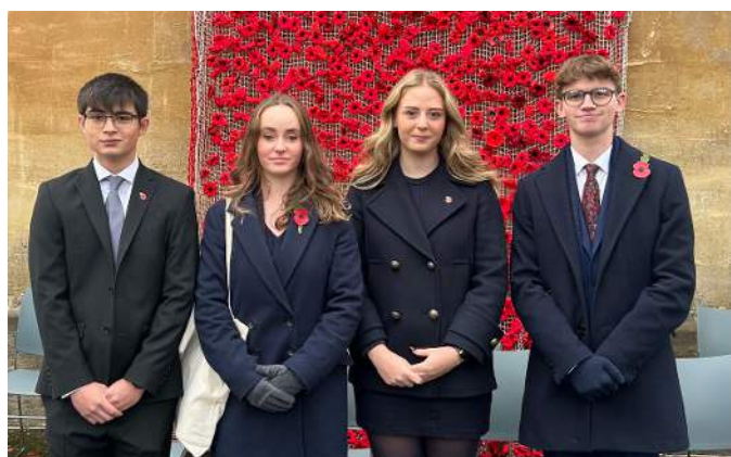
Head and Deputy Head students represent the school at the Buckingham Remembrance Parade