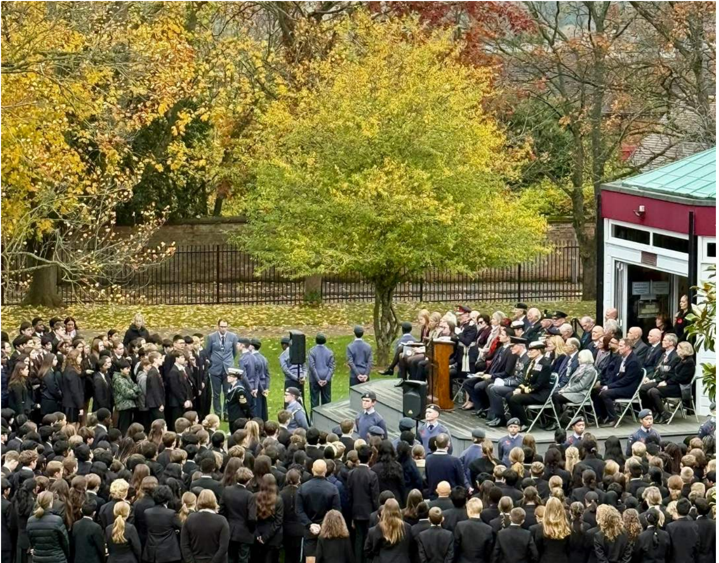
The whole school assembled on the front lawn

On Friday, 7th November, we held our annual Remembrance Day service, with all students and staff gathering on the front lawn of the school, next to the Green Room stage.