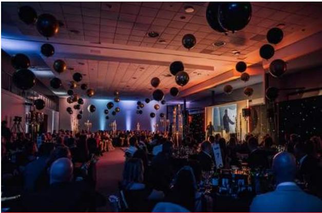
The gala dinner under way at Stadium MK