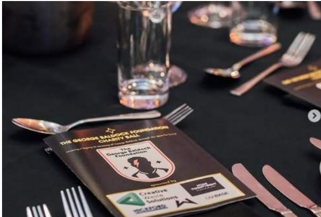
The event set up and ready to start