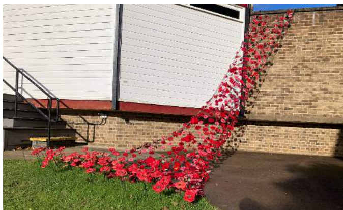
The student-created poppy cascade on the school building