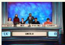
Old Latin news