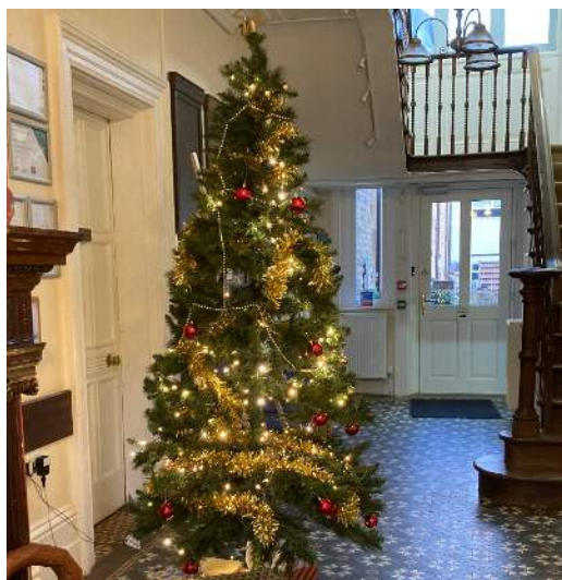
Christmas 2025 in Brookfield

Other future Lillingstone Lecture dates will be published on RLS Connect when confirmed.